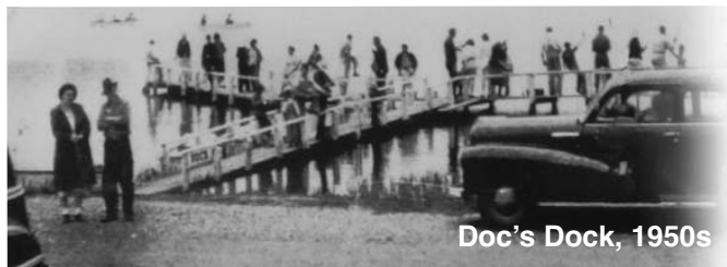
Doc's Dock, 1950s

Channel Inn (1948) Located across the Canon from Doc's Dock is the Channel Inn. Over the years, this spot has been the location of a general store and Orcutt's Supper Club. The Channel Inn offers food, drinks and entertainment.