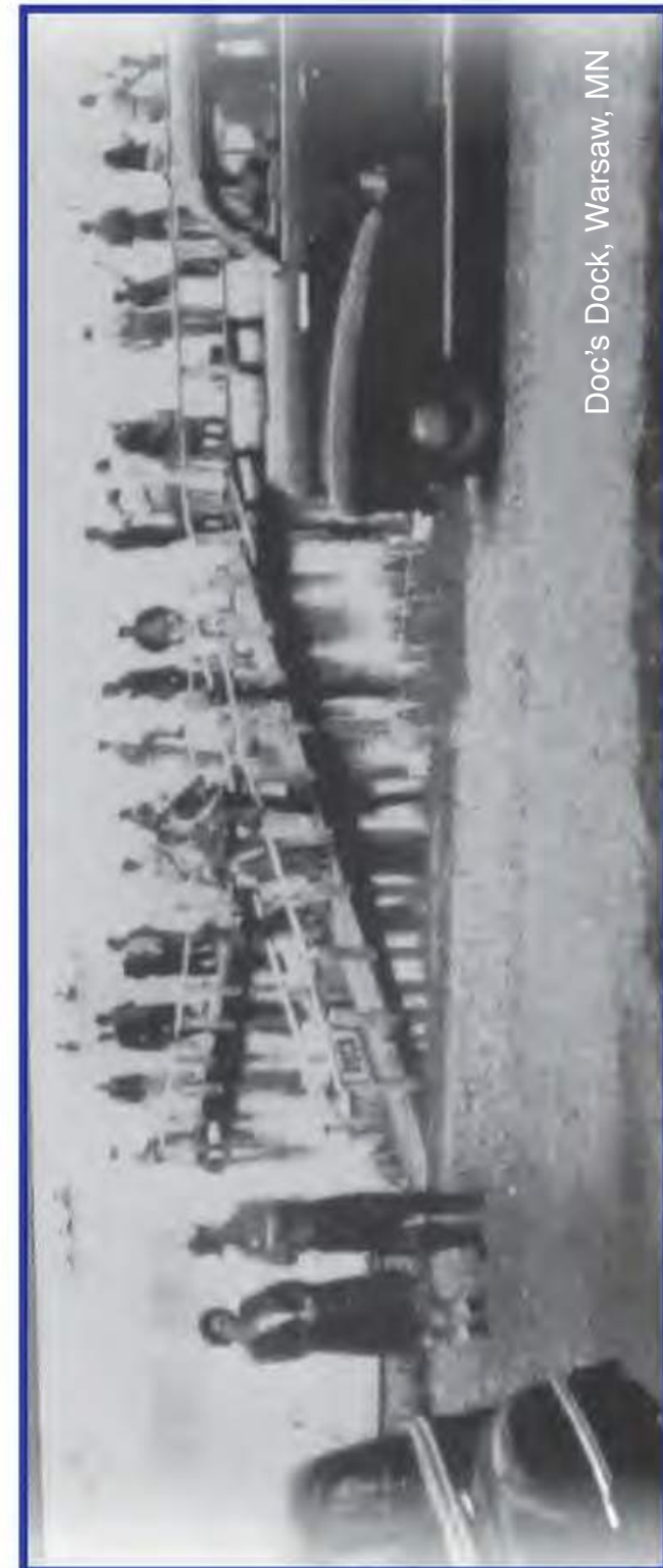
Doc's Dock, Warsaw, MN