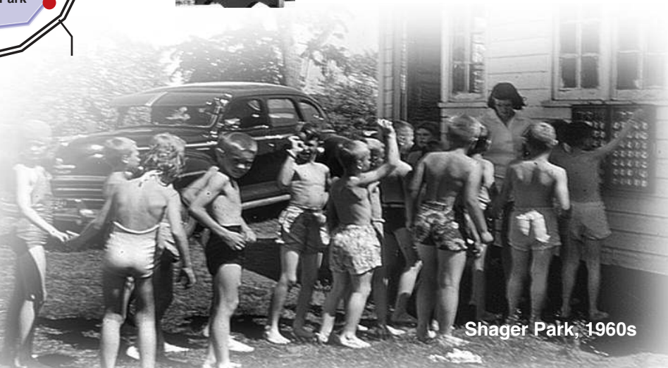
Shager Park, 1960s

Shager Park (1968) This park, known as "Malibu," has always been a popular public swimming hole during hot weather months. More recently, the Park has been enlarged and turned into an official county park offering a boat launch, access to the Sakatah-Singing Hills Trail, and top notch picnic facilities.